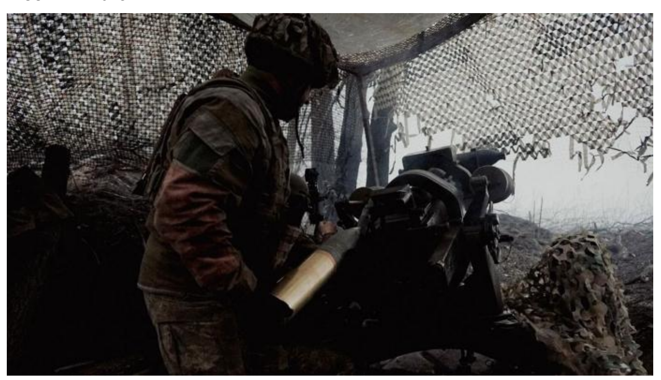
UKRAINIAN WARRIOR.

7:30 AM: Summary of Battlefield events on March 11 General Command 7:00 AM March 12